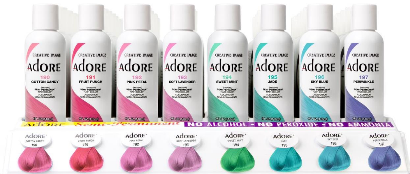
COTTON CANDY 190